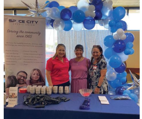
August 2023 - We had the privilege of attending and sponsoring the Brazosport Association of Retired Teachers breakfast!