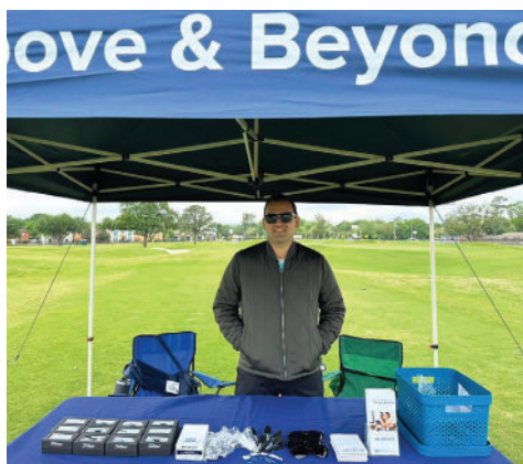
March 2023 - We were at Wildcat Golf Club supporting the INEOS ICAN Foundation's Golf Classic Fundraiser.