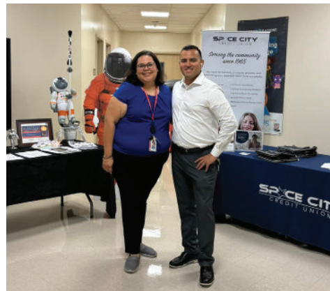
September 2023 - We visited Harvey Brown Elementary School's open house. Parents had a chance to see an array of awesome new initiatives and programs the school provides for children.