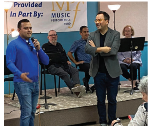
October 2023 - We attended the Houston Professional Musicians' Association freelance contracting meeting.