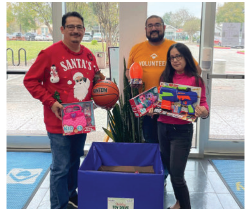
December 2023 - We partnered with Baker Ripley for their annual toy drive. They provided toys for over 200 children!