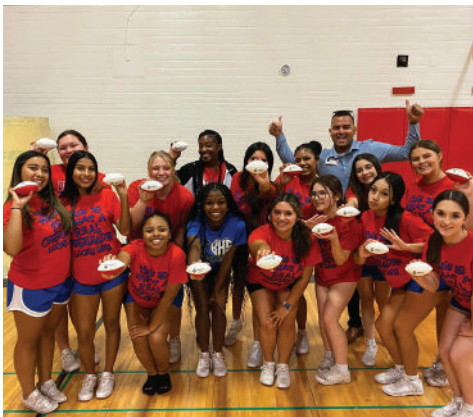
September 2023 - Space City CU was happy to support Brazosport High School and their cheerleaders with some awesome branded footballs with their school logos!