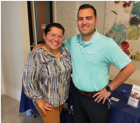
January 2023 - We visited with residents at a local apartment complex, Campanile on Commerce Apartments.