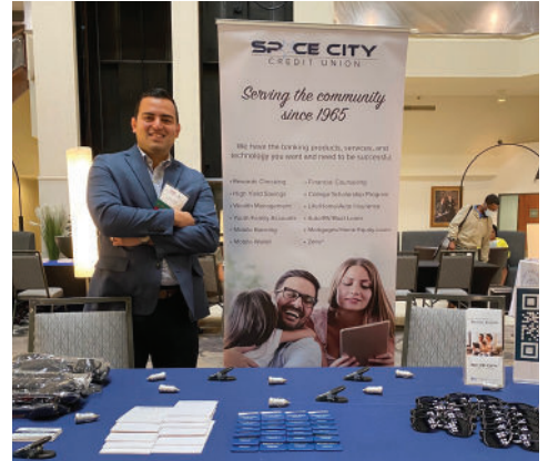
March 2023 - We had the pleasure of attending the Houston East End Chamber's annual Women In Business Luncheon.