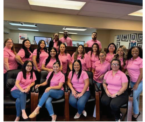
October 2023 - In honor of Breast Cancer Awareness month Space City CU participated in a month-long employee fundraising campaign. Through this campaign, we were able to raise almost $6,000 towards the cause.