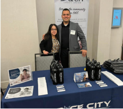
October 2023 - Houston East End Chamber's "Port Houston Appreciation Day" annual event.