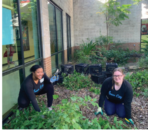
October 2023 - Our Team did some cleaning and gardening with the local non profit organization, Urban Harvest. They invited us out to help with Lantrip Elementary School's beautification project.