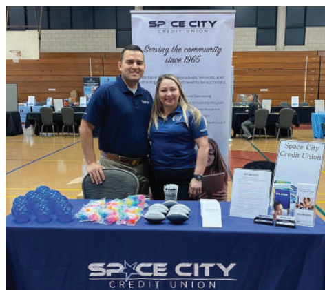
April 2023 - Brazosport College invited us to their Annual Career Day event!