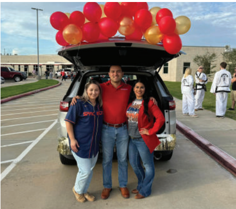
November 2023 - In honor of Red ribbon week, Space City CU partnered with TW Ogg Elementary School in Clute, TX for their annual parade to raise awareness to "Say No to Drugs."