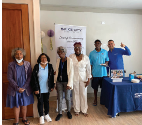
July 2023 - We visited the residents of Scott Street Lofts! They enjoyed refreshments, games, and a small presentation on the benefits of joining a credit union.