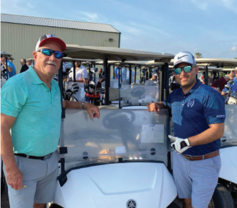
June 2023 - Space City Credit Union was a proud sponsor and supporter of Brazoswood High School's Annual Golf Tournament.