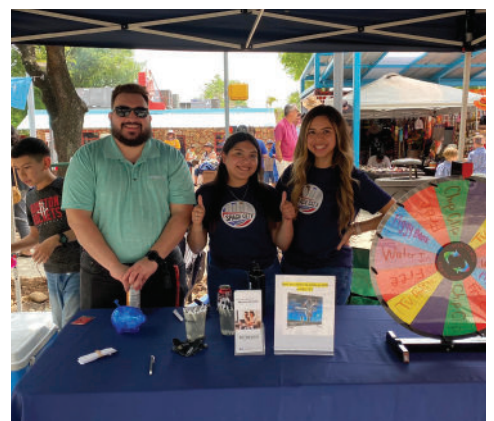
May 2023 - We were again a proud contributor and sponsor of the East End Street Fest!