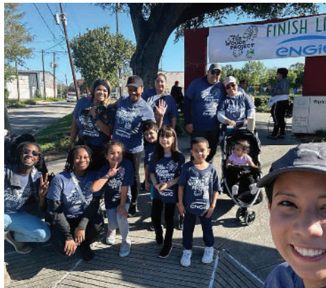
November 2023 - We had an awesome time participating in The Woods Project's annual walk!